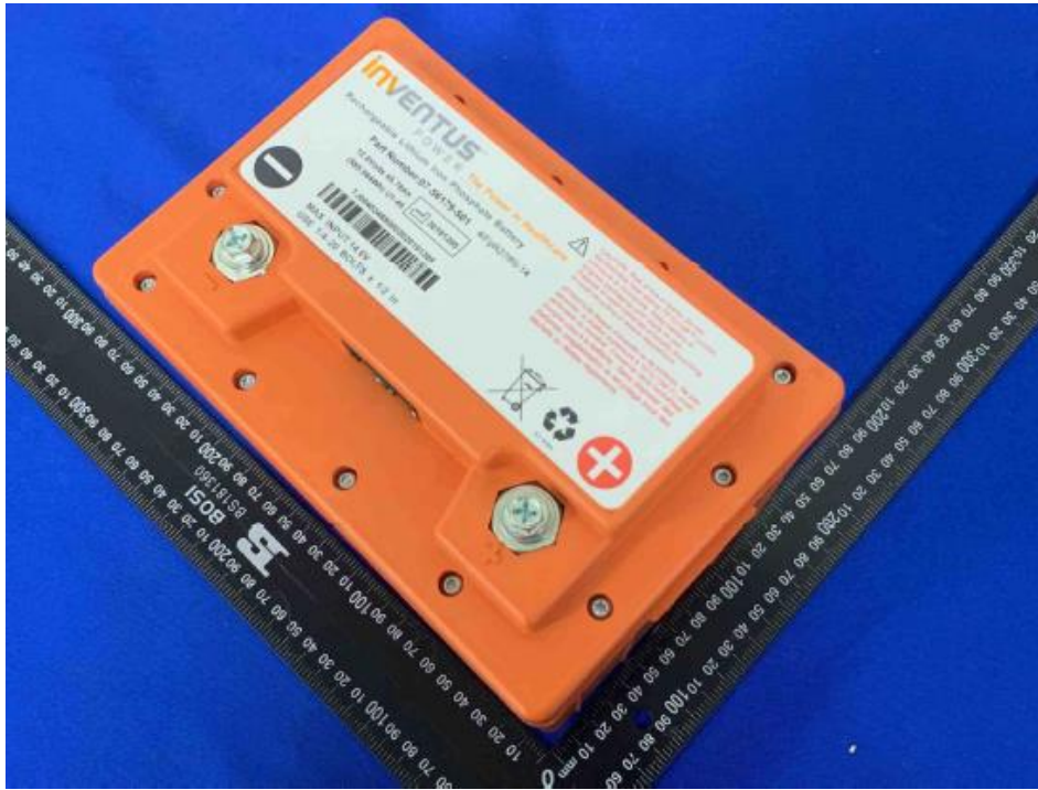
Figure 1 Overall view I of battery