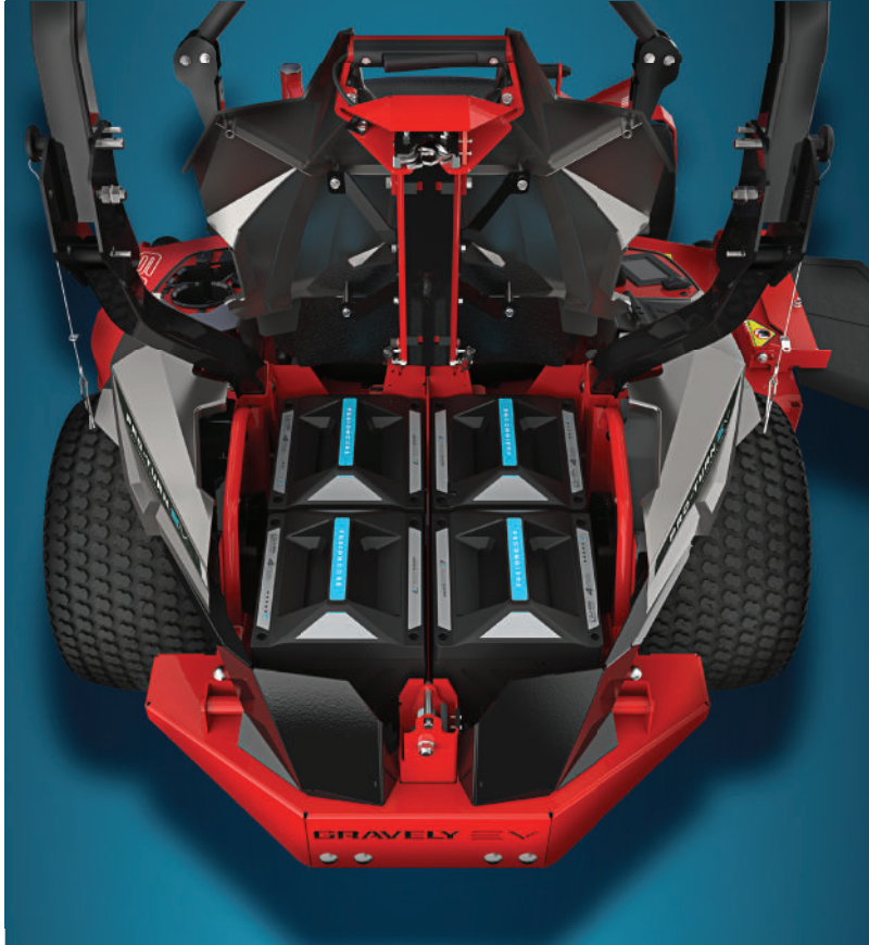
Gravelly® 60" PRO-TURN® EV – Electric Commercial Zero Turn Mower